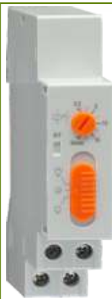
□ Function diagram